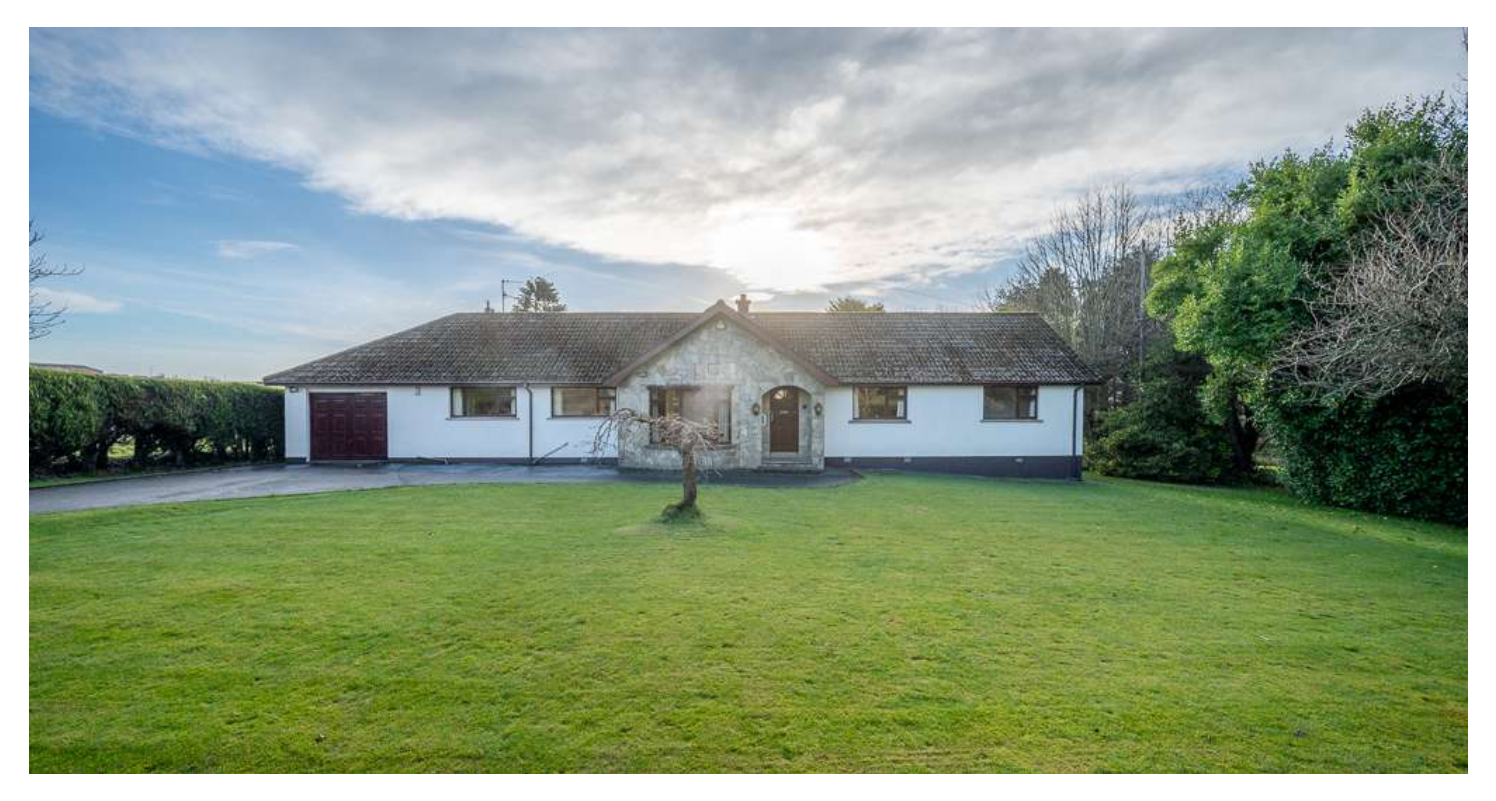
DETACHED | 5 ⊨ | 2 ≒ | 2 ⊟

It is unusual for properties with such potential to become available especially in a location as desirable as this one. This home provides privacy combined with excellent convenience.