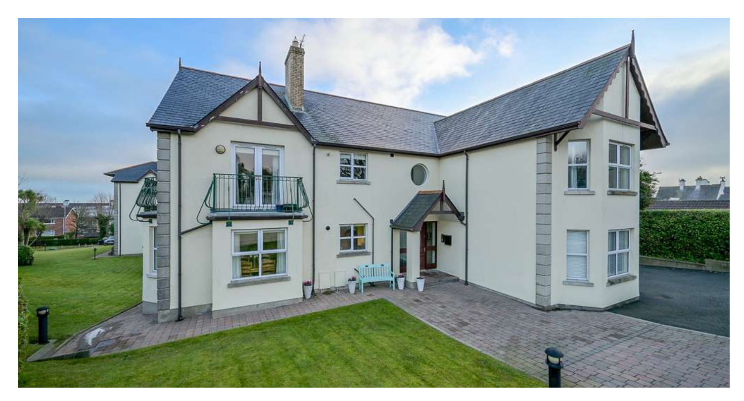
GROUND FLOOR APARTMENT | 2 ⊨ | 2 ≒ | 1 ⊟

This beautifully presented ground-floor apartment, located in the highly soughtafter and prestigious area of Bangor, offers the perfect balance of modern living and comfort.