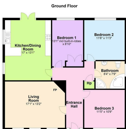
8 Dunleath Avenue, Downpatrick

Terms & Conditions: Please note that these particulars do not constitute an offer or contract of sale. Any prospective purchaser should satisfy themselves by thorough inspection of the property and we recommend that any prospective purchaser should employ the professional services of a building surveyor and consider their findings prior to entering into contract. All such fees associated with this work will be the responsibility of the prospective purchaser regardless of whether the sale completes or not. In addition, none of the appliances or installations have been tested in any way whatsoever and it is our recommendation that a purchaser should fully satisfy themselves by employing an appropriate expert. We would also like to advise that our measurements are taken from the widest points of each room and should not be relied upon as completely accurate. You should not make decisions based on the measurements provided and double check measurements at all times. Valuation/Mortgage Service: As part of our service we would remind Vendors and potential purchasers that we have a Mortgage Broker available at this branch. If you are thinking of selling, we would be happy to carry out a free market appraisal of your property.