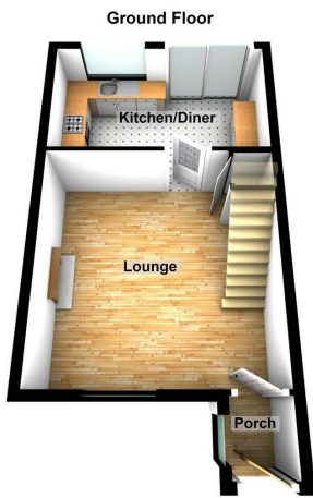
Images for illustrative purposes only and subject to change. Plan produced using PlanUp.