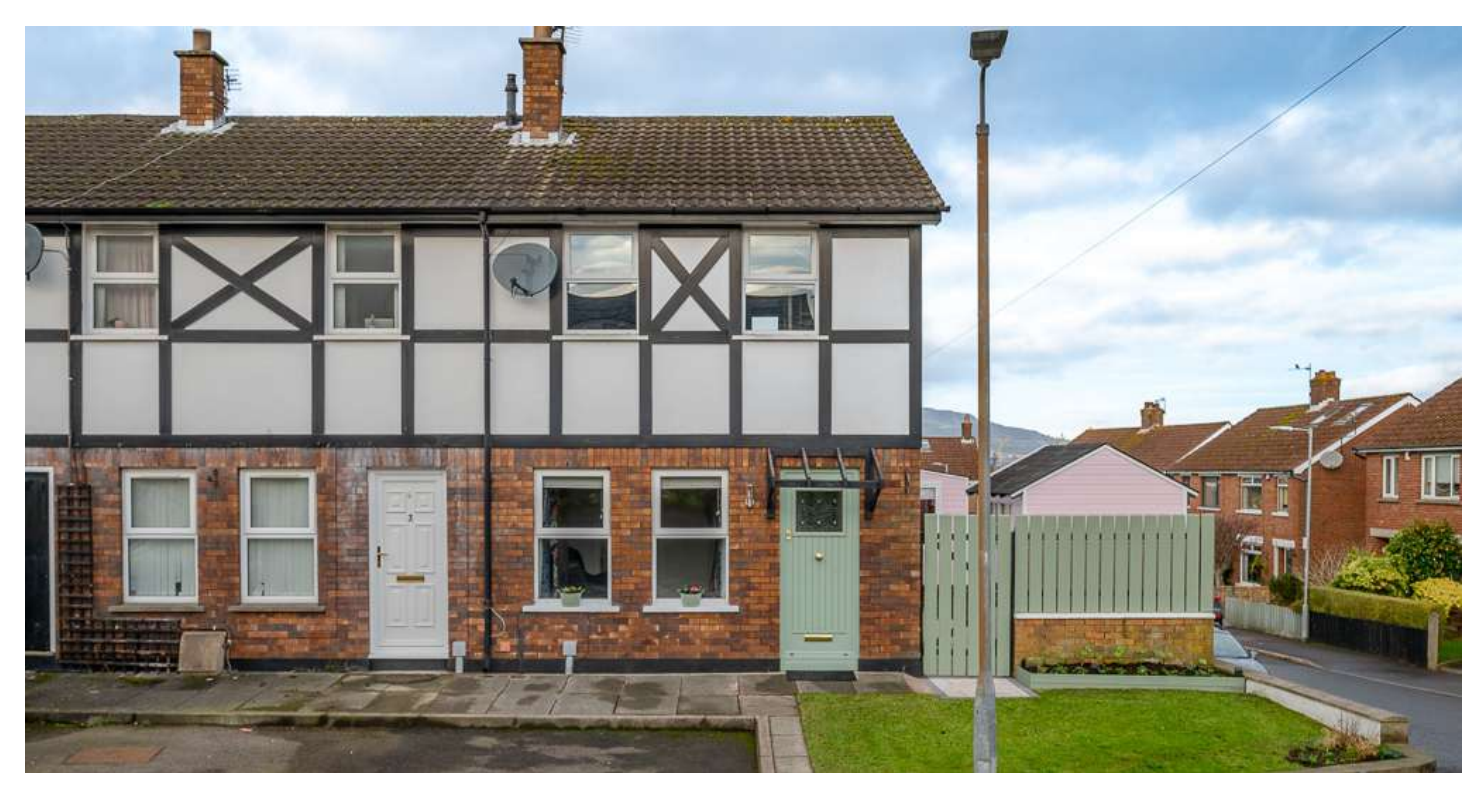
END TERRACE | 3 ⊨ | 1 ≒ | 2 ⊟

We are delighted to bring to the market this attractive three-bedroom end terrace property located off the prestigious Circular Road in East Belfast.