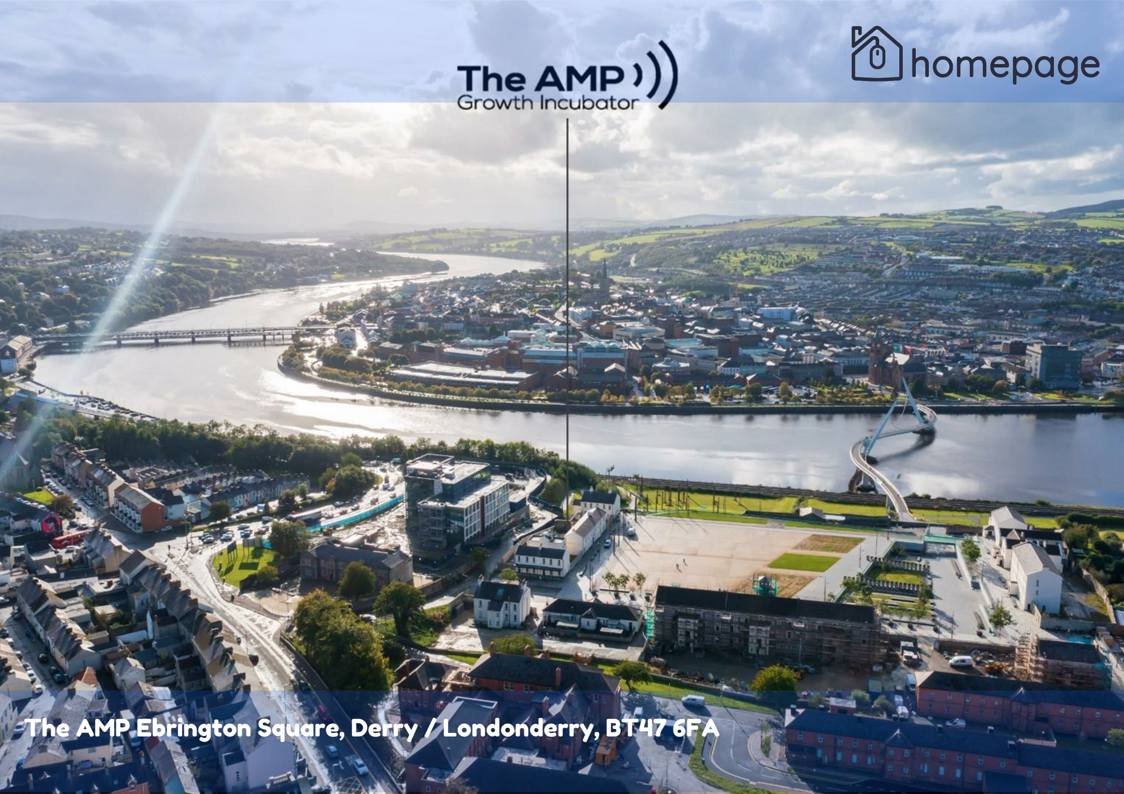
The AMP Ebrington Square, Derry / Londonderry, BT47 6FA