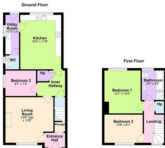
33 Rathfriland Road, Dromara