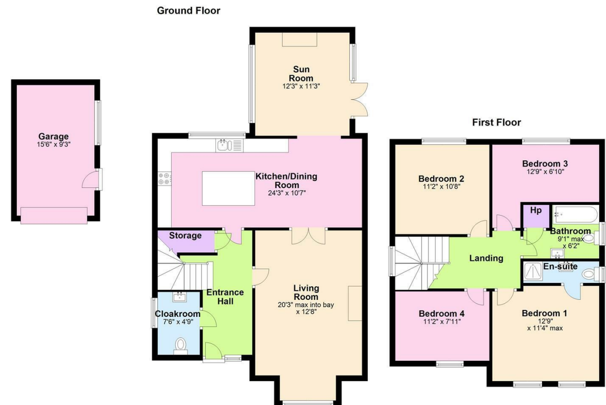
48 Cloverdale, Blackskull, Dromore