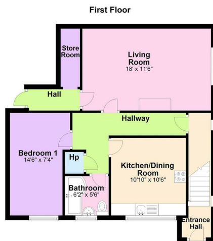
5D Leamont, Banbridge

Terms & Conditions: Please note that these particulars do not constitute an offer or contract of sale. Any prospective purchaser should satisfy themselves by thorough inspection of the property and we recommend that any prospective purchaser should employ the professional services of a building surveyor and consider their findings prior to entering into contract. All such fees associated with this work will be the responsibility of the prospective purchaser regardless of whether the sale completes or not. In addition, none of the appliances or installations have been tested in any way whatsoever and it is our recommendation that a purchaser should fully satisfy themselves by employing an appropriate expert. We would also like to advise that our measurements are taken from the widest points of each room and should not be relied upon as completely accurate. You should not make decisions based on the measurements provided and double check measurements at all times. Valuation/Mortgage Service: As part of our service we would remind Vendors and potential purchasers that we have a Mortgage Broker available at this branch. If you are thinking of selling, we would be happy to carry out a free market appraisal of your property.