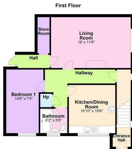
5D Leamont, Banbridge

Terms & Conditions: Please note that these particulars do not constitute an offer or contract of sale. Any prospective purchaser should satisfy themselves by thorough inspection of the property and we recommend that any prospective purchaser should employ the professional services of a building surveyor and consider their findings prior to entering into contract. All such fees associated with this work will be the responsibility of the prospective purchaser regardless of whether the sale completes or not. In addition, none of the appliances or installations have been tested in any way whatsoever and it is our recommendation that a purchaser should fully satisfy themselves by employing an appropriate expert. We would also like to advise that our measurements are taken from the widest points of each room and should not be relied upon as completely accurate. You should not make decisions based on the measurements provided and double check measurements at all times. Valuation/Mortgage Service: As part of our service we would remind Vendors and potential purchasers that we have a Mortgage Broker available at this branch. If you are thinking of selling, we would be happy to carry out a free market appraisal of your property.