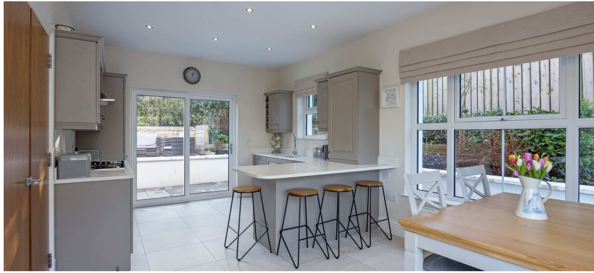
Kitchen open to casul dining and sitting area