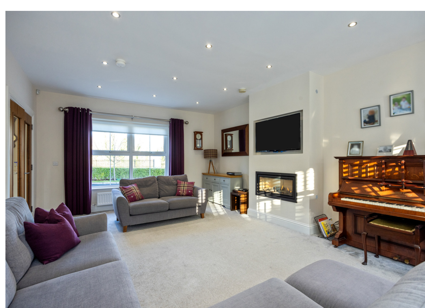
EXPERIENCE | EXPERTISE | RESULTS