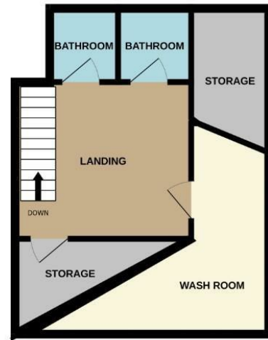
1ST FLOOR 362 sq.ft. (33.6 sq.m.) approx.