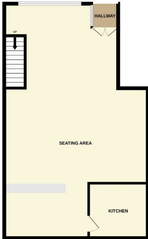
GROUND FLOOR 753 sq.ft. (69.9 sq.m.) approx.