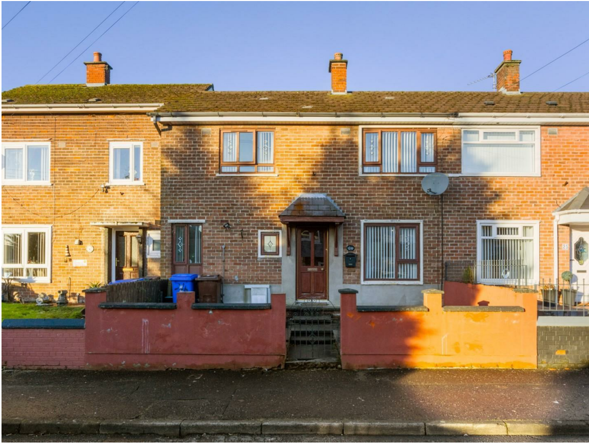
24 Mount Vernon Gardens, Belfast, BT15 4BQ