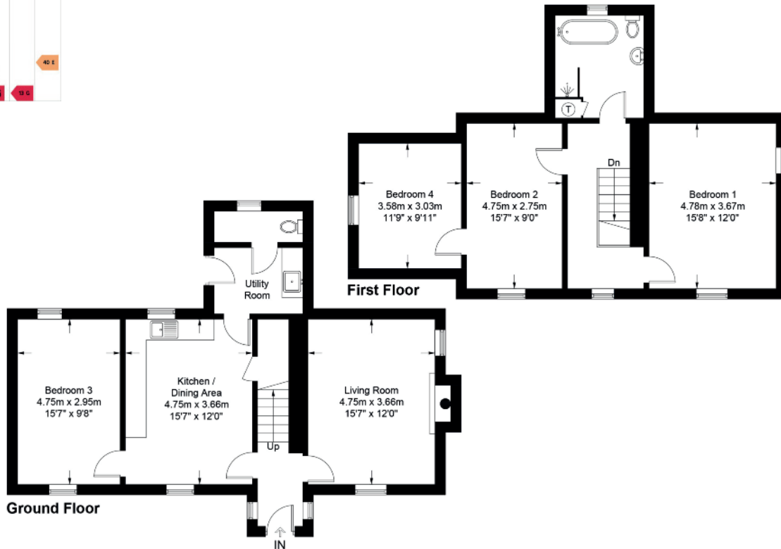
Illustration for identification purposes only, measurements are approximate, not to scale. Fourlabs.co © (ID1157243)