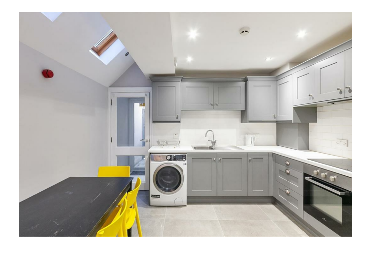
KITCHEN / LIVING / DINING AREA 21'3" x 11'5" (6.5 x 3.5)