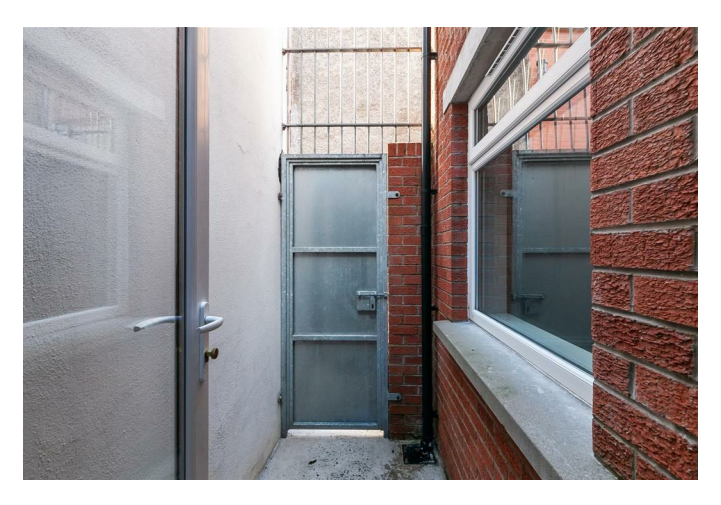
Enclosed yard to rear.