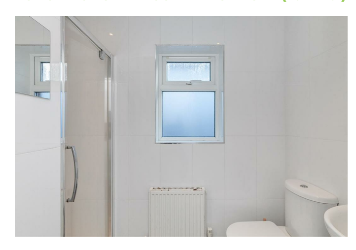
Comprising thermostatic shower, low flush W.C, pedestal sink unit with mixer tap, fully tiled walls and tiled floor.