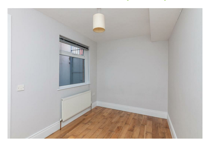
Solid hardwood flooring.