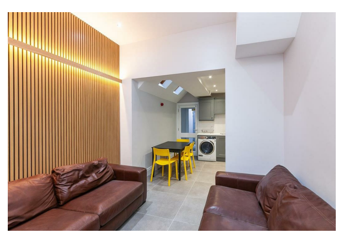
Feature wall with concealed lighting.