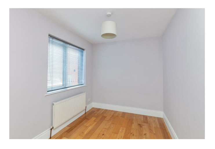
Solid hardwood flooring.