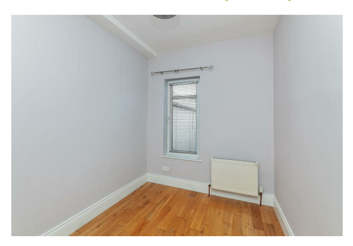
Solid hardwood flooring.