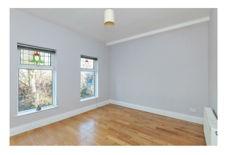
Solid hardwood flooring.