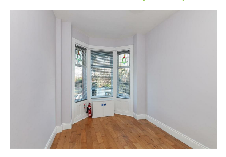
Solid hardwood flooring throughout.