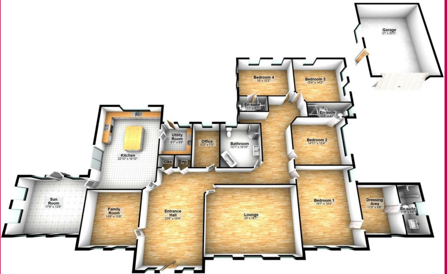
36 Tullyhubbert Road, Moneyreagh