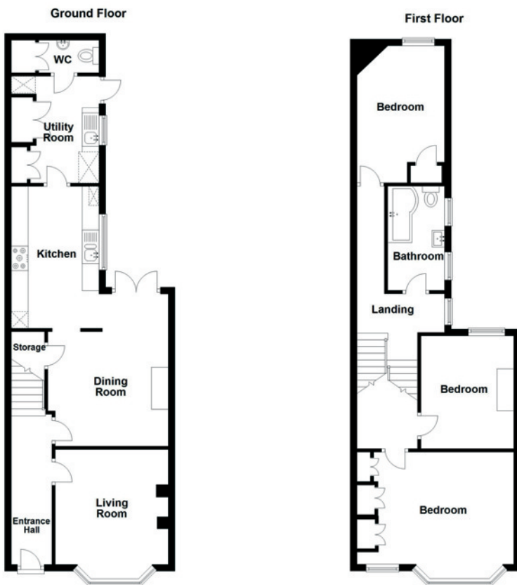
26 Haddington Gardens, Belfast

Heading countrybound on the Cregagh Road, Haddington Gardens is located on the right, shortly before the Ladas Drive roundabout.