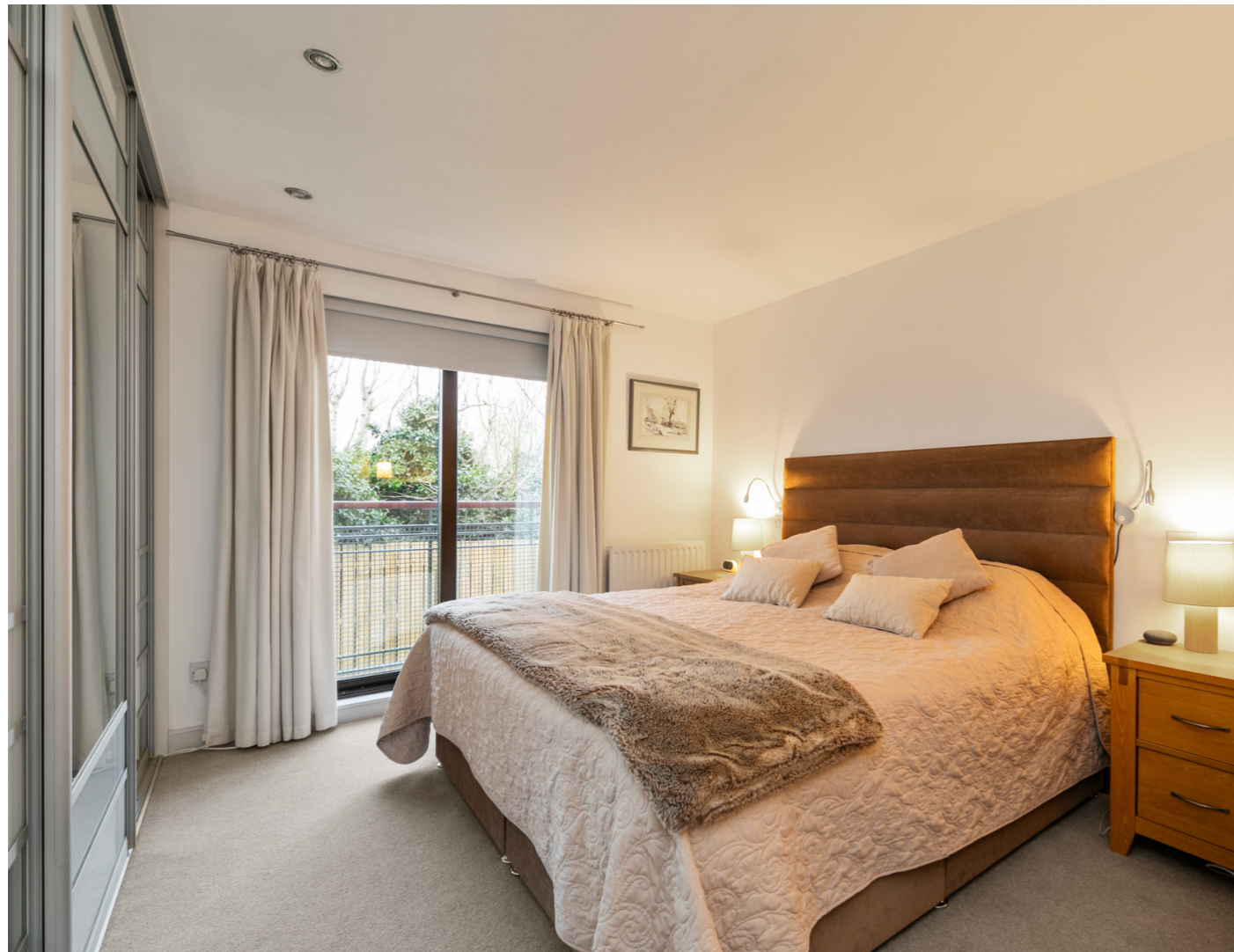
Bedroom one with extensive built in wardrobes and 'Juliet' balcony