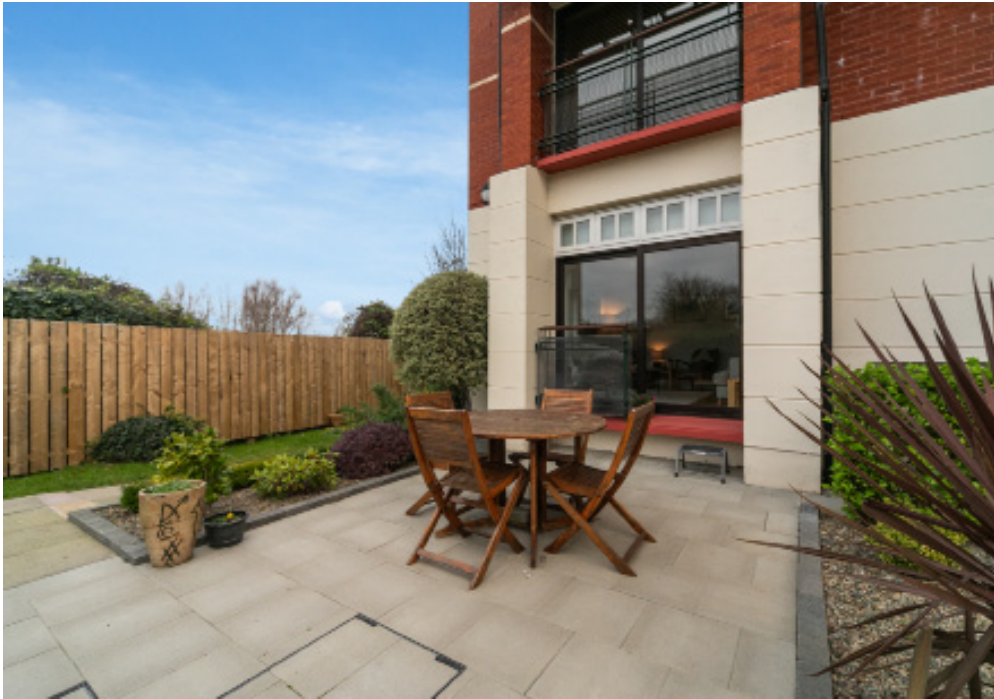
Privately owned sunny patio leading to maintained gardens