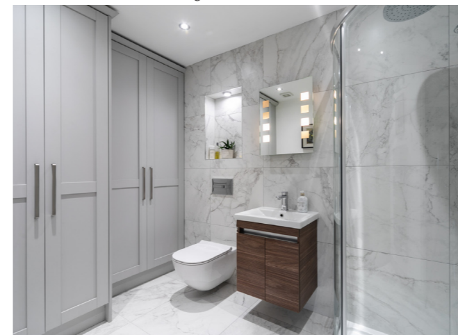
Shower room with concealed utility area