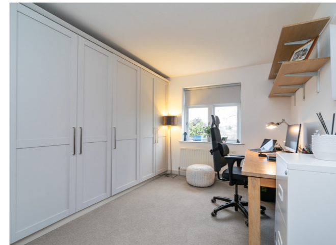
Bedroom two or study