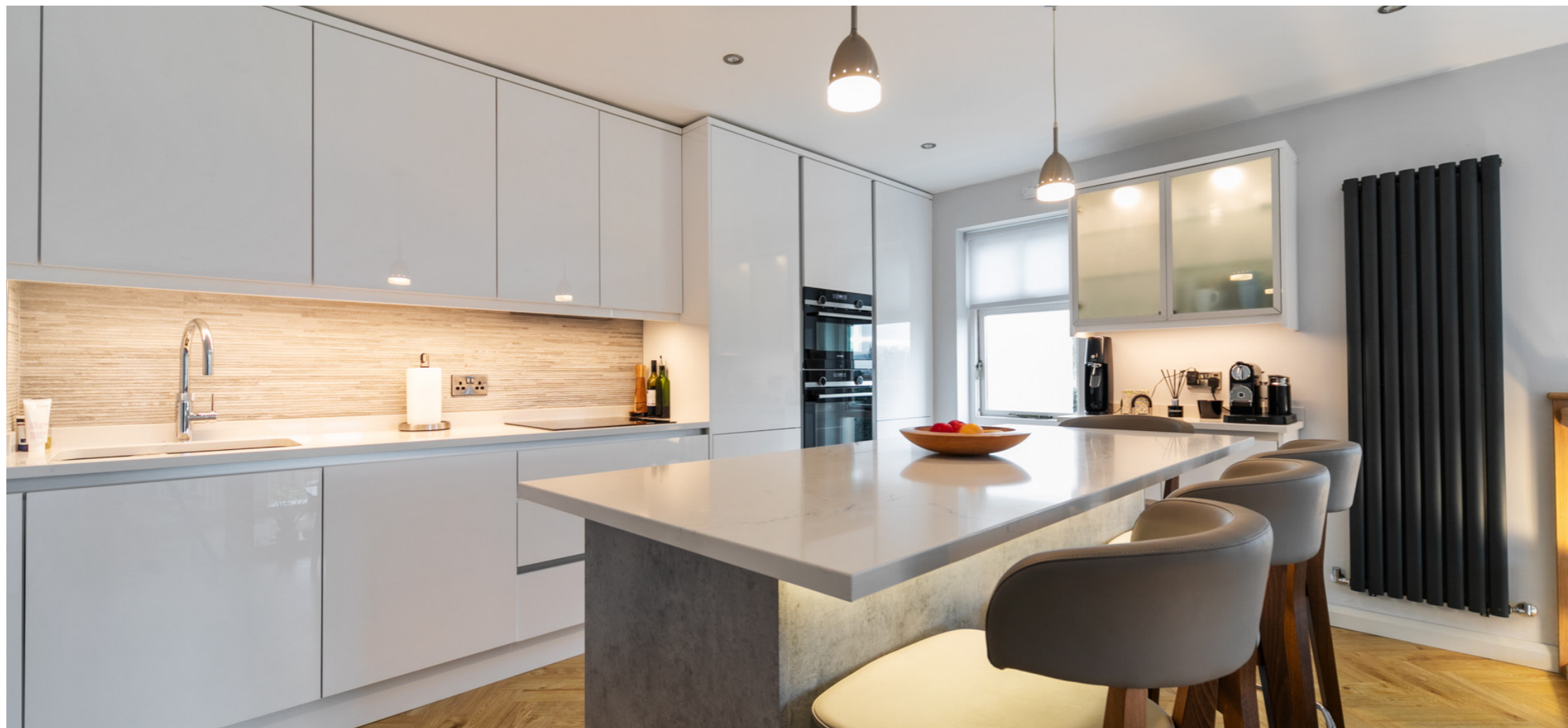
Stunning modern kitchen with excellent range of units and quality appliances