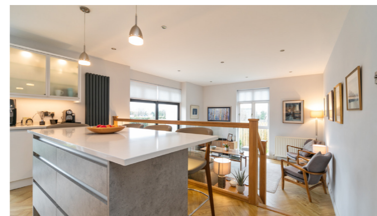
Steps down to bright living room with high ceiling and double aspect