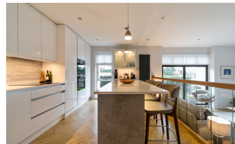
Centre island dining