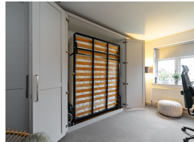
Bedroom two with built in storage and concealed double bed