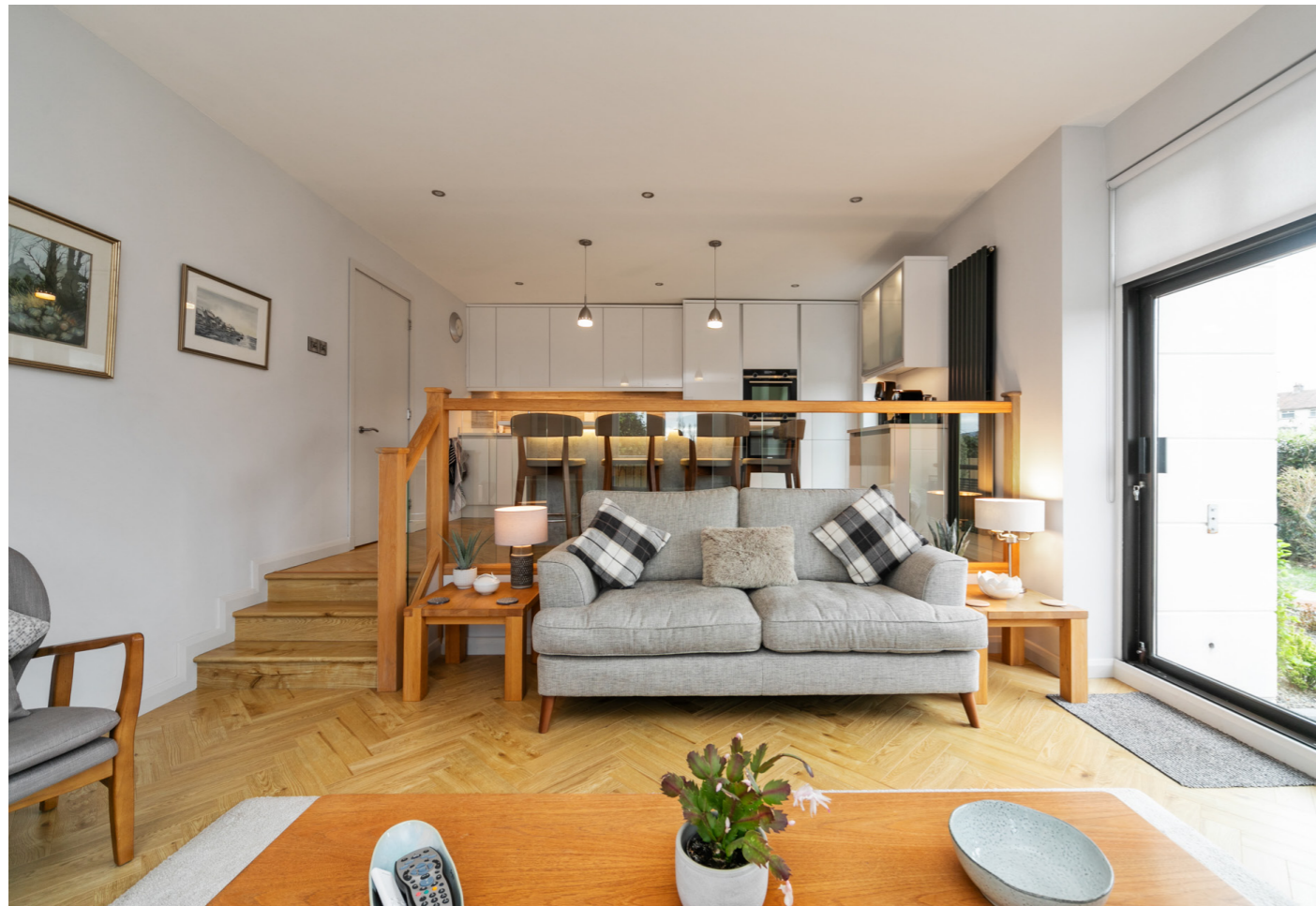
Living room open to kitchen