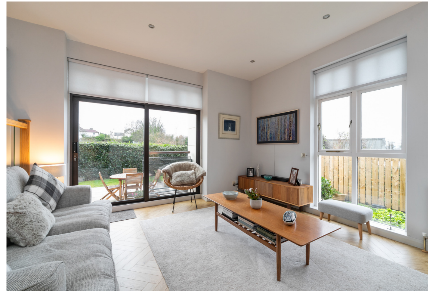
Bright Living room with double aspect and out to sunny patio