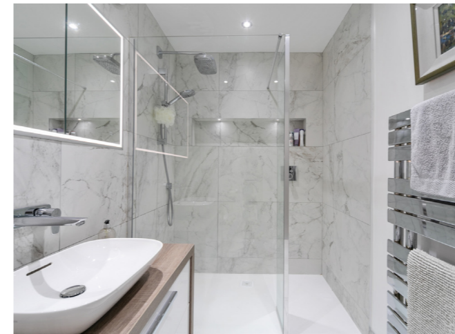
Beautifully finished Ensuite shower room

Sunny, privately owned patio and access to shared gardens.