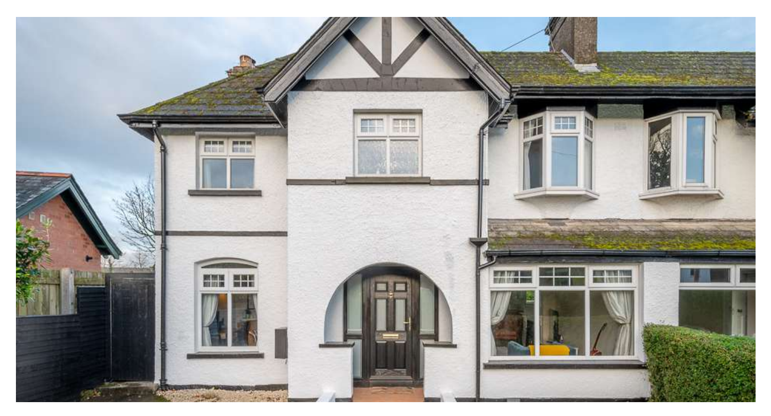
SEMI-DETACHED | 3 ⊨ | 1 ≒ | 2 ⊟

Ben Vista Park is located within Cultra in one of North Down's most sought after residential locations. This Park is a select cul-de-sac with a proven track record for strong demand. Number 1 is a period semi detached exuding charm and character throughout.