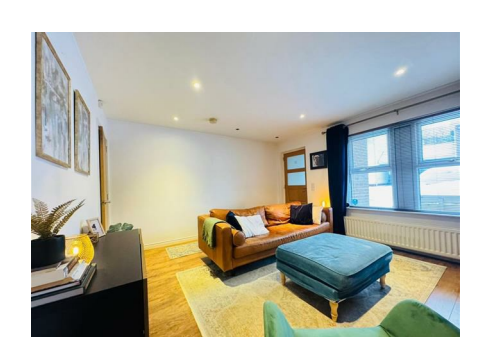
30 Alderley Place Mallusk, Newtownabbey, BT36 7WW