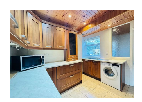
60 Rathmore Drive Rathcoole, Newtownabbey, BT37 9BW