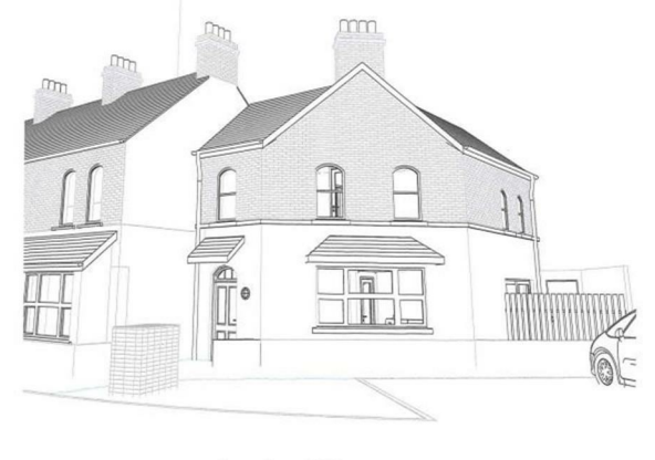
low level front view