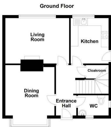
Disclaimer: Plans are for illustrative purposes only. Plan produced using PlanUp. 2 Armoy Gardens, Belfast