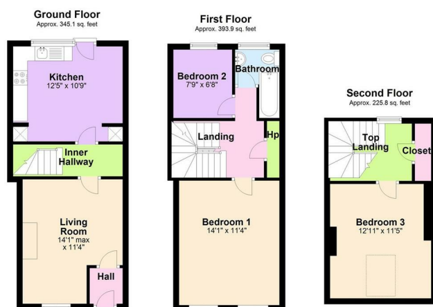
Total area: approx. 964.8 sq. feet

Terms & Conditions: Please note that these particulars do not constitute an offer or contract of sale. Any prospective purchaser should satisfy themselves by thorough inspection of the property and we recommend that any prospective purchaser should employ the professional services of a building surveyor and consider their findings prior to entering into contract. All such fees associated with this work will be the responsibility of the prospective purchaser regardless of whether the sale completes or not. In addition, none of the appliances or installations have been tested in any way whatsoever and it is our recommendation that a purchaser should fully satisfy themselves by employing an appropriate expert. We would also like to advise that our measurements are taken from the widest points of each room and should not be relied upon as completely accurate. You should not make decisions based on the measurements provided and double check measurements at all times. Valuation/Mortgage Service: As part of our service we would remind Vendors and potential purchasers that we have a Mortgage Broker available at this branch. If you are thinking of selling, we would be happy to carry out a free market appraisal of your property.