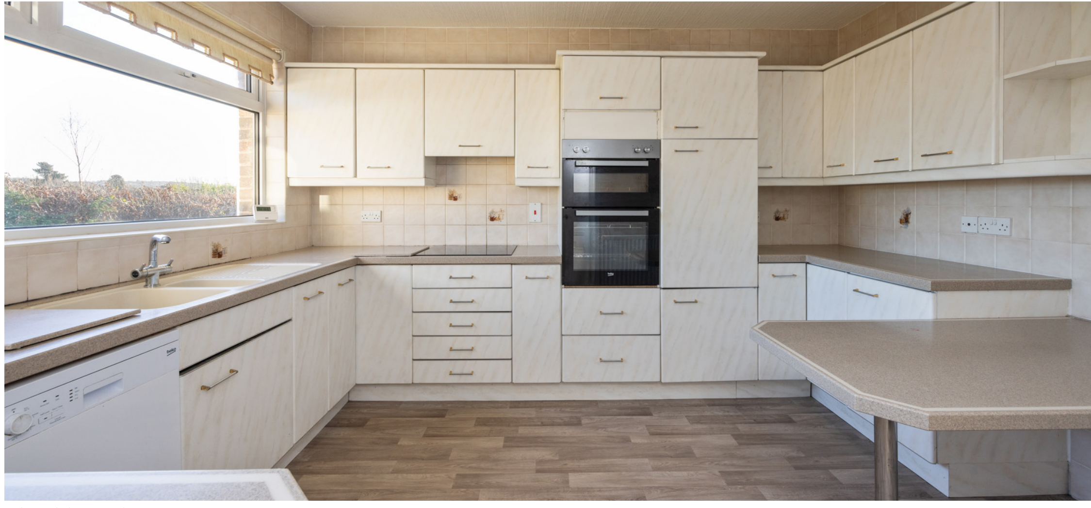
Kitchen overlooking rear garden

Dining room which could be separated with doors if required