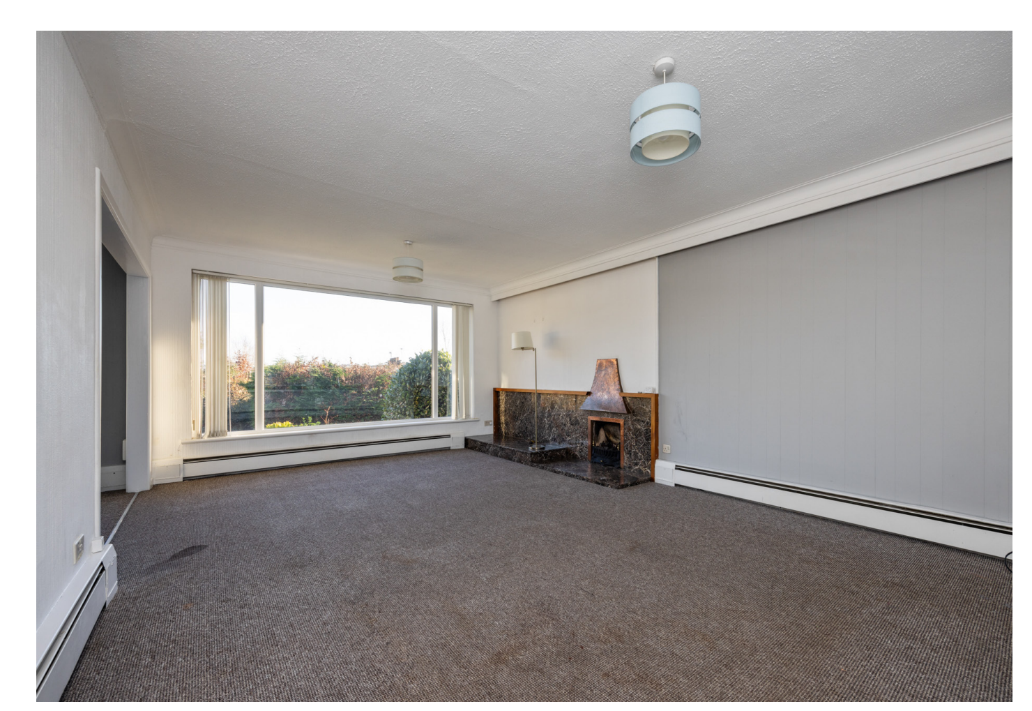
Bright Living room