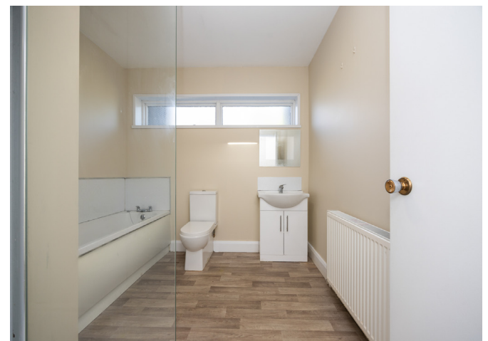
Bathroom with bath and shower