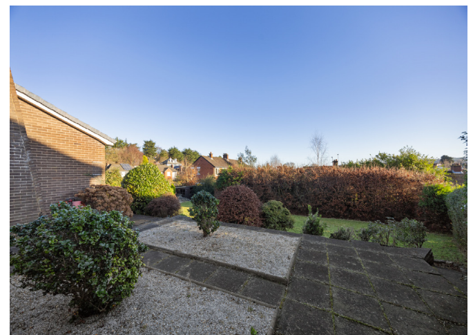
Flagged patio area