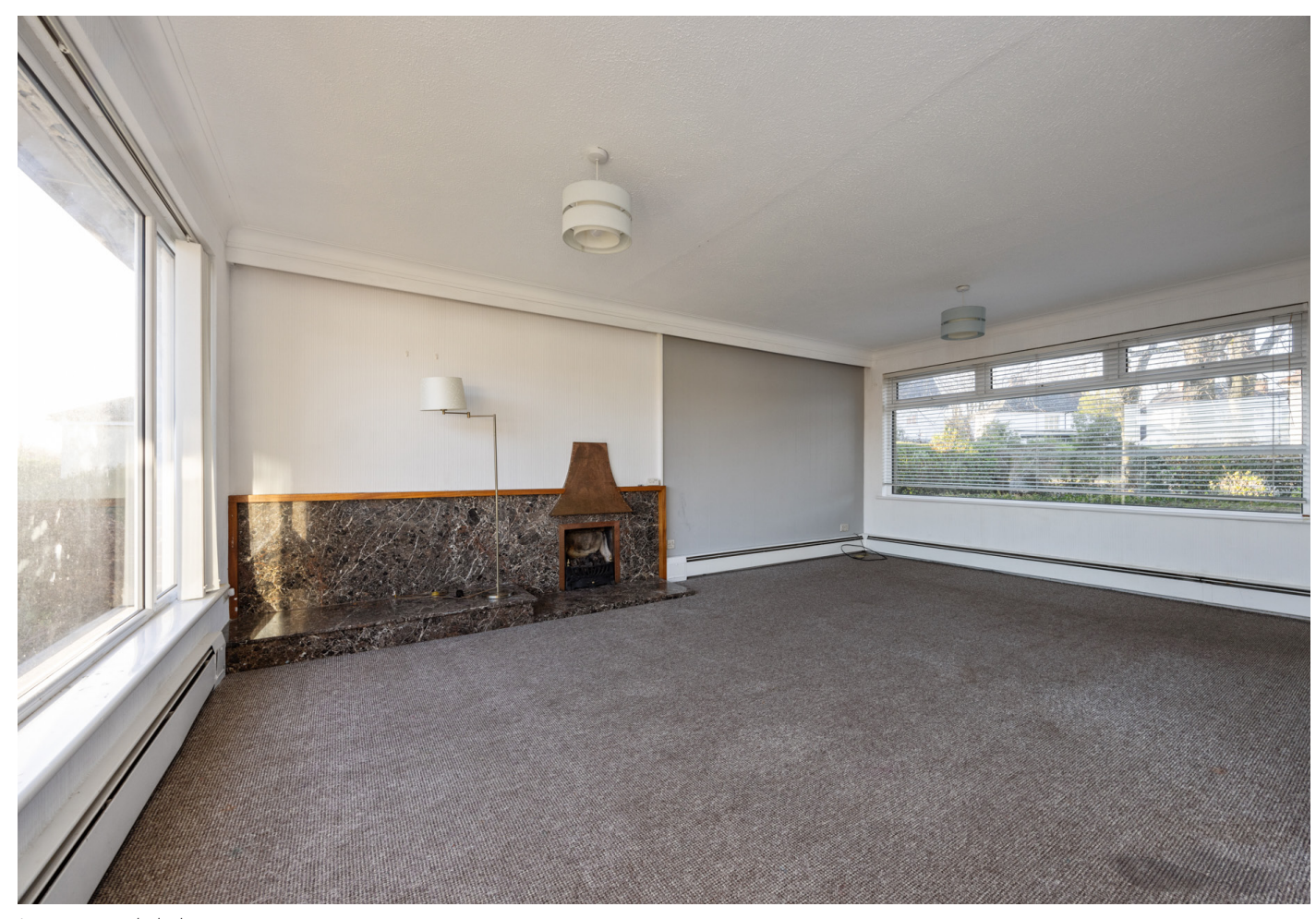
Living room with dual aspect