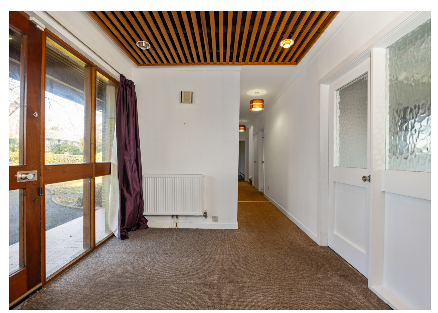
EXPERIENCE | EXPERTISE | RESULTS