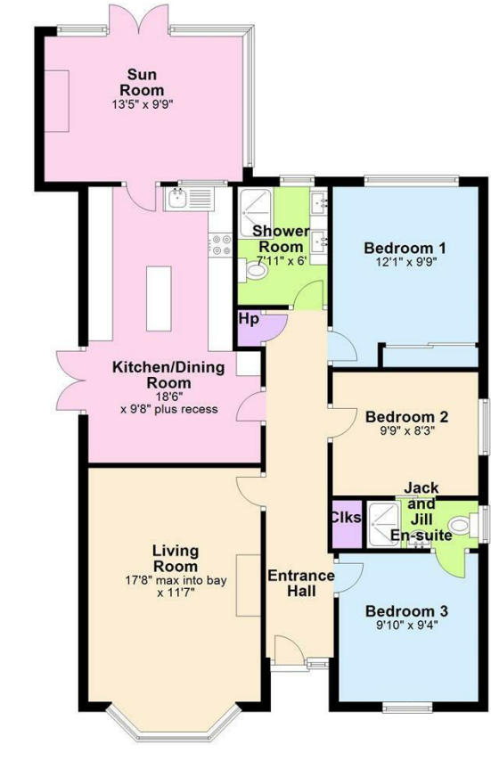
32 Mourne Grange, Dromore