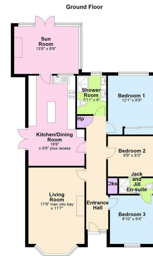
32 Mourne Grange, Dromore

If you require a viewing please get in contact via phone Leanne on 02840622226/07703612260 or email - banbridge@quinnestateagents.com