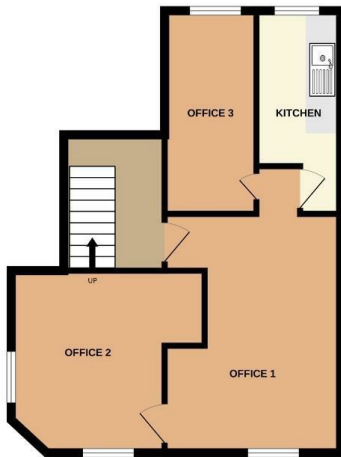
GROUND FLOOR 496 sq.ft. (46.1 sq.m.) approx.