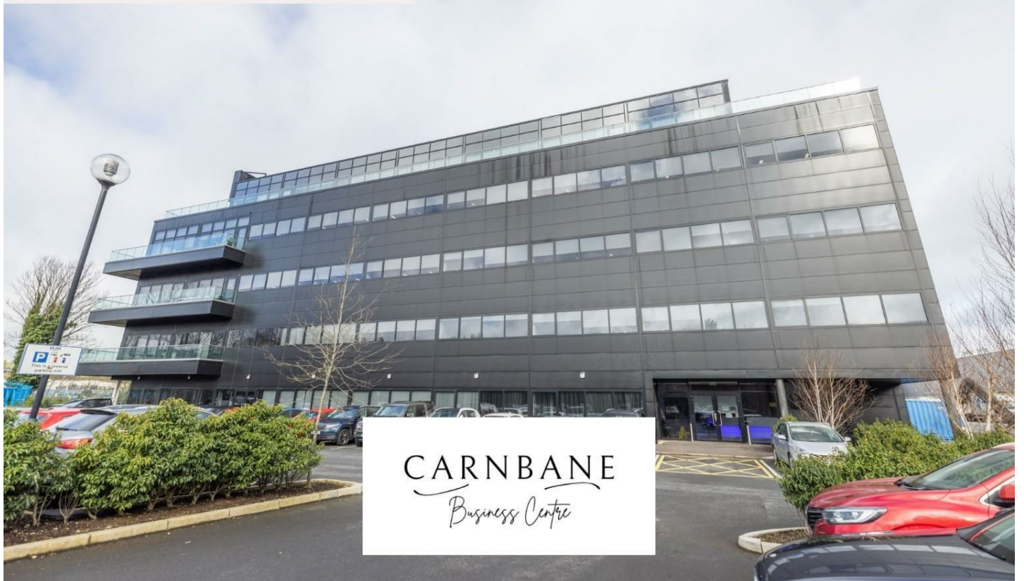
Office 4, Carnbane Business Centre