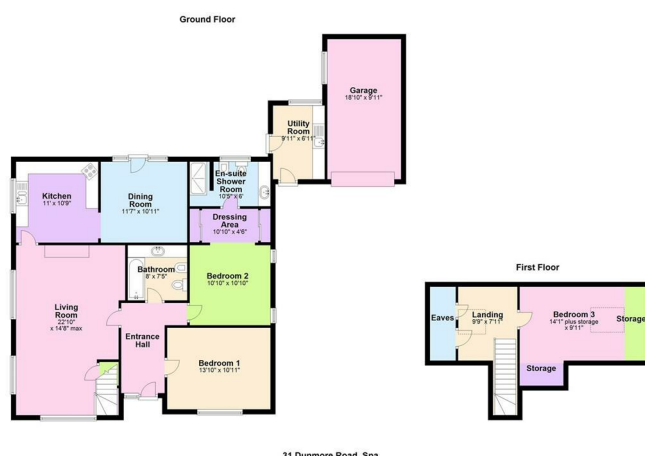
31 Dunmore Road, Spa

Terms & Conditions: Please note that these particulars do not constitute an offer or contract of sale. Any prospective purchaser should satisfy themselves by thorough inspection of the property and we recommend that any prospective purchaser should employ the professional services of a building surveyor and consider their findings prior to entering into contract. All such fees associated with this work will be the responsibility of the prospective purchaser regardless of whether the sale completes or not. In addition, none of the appliances or installations have been tested in any way whatsoever and it is our recommendation that a purchaser should fully satisfy themselves by employing an appropriate expert. We would also like to advise that our measurements are taken from the widest points of each room and should not be relied upon as completely accurate. You should not make decisions based on the measurements provided and double check measurements at all times. Valuation/Mortgage Service: As part of our service we would remind Vendors and potential purchasers that we have a Mortgage Broker available at this branch. If you are thinking of selling, we would be happy to carry out a free market appraisal of your property.