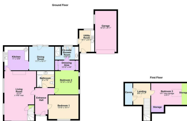
31 Dunmore Road, Spa

Terms & Conditions: Please note that these particulars do not constitute an offer or contract of sale. Any prospective purchaser should satisfy themselves by thorough inspection of the property and we recommend that any prospective purchaser should employ the professional services of a building surveyor and consider their findings prior to entering into contract. All such fees associated with this work will be the responsibility of the prospective purchaser regardless of whether the sale completes or not. In addition, none of the appliances or installations have been tested in any way whatsoever and it is our recommendation that a purchaser should fully satisfy themselves by employing an appropriate expert. We would also like to advise that our measurements are taken from the widest points of each room and should not be relied upon as completely accurate. You should not make decisions based on the measurements provided and double check measurements at all times. Valuation/Mortgage Service: As part of our service we would remind Vendors and potential purchasers that we have a Mortgage Broker available at this branch. If you are thinking of selling, we would be happy to carry out a free market appraisal of your property.