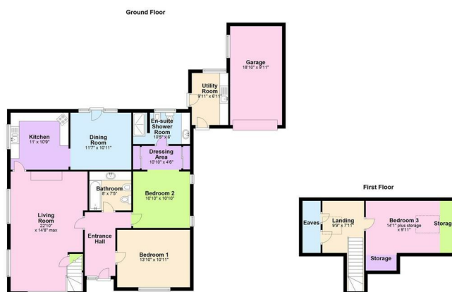
31 Dunmore Road, Spa

Terms & Conditions: Please note that these particulars do not constitute an offer or contract of sale. Any prospective purchaser should satisfy themselves by thorough inspection of the property and we recommend that any prospective purchaser should employ the professional services of a building surveyor and consider their findings prior to entering into contract. All such fees associated with this work will be the responsibility of the prospective purchaser regardless of whether the sale completes or not. In addition, none of the appliances or installations have been tested in any way whatsoever and it is our recommendation that a purchaser should fully satisfy themselves by employing an appropriate expert. We would also like to advise that our measurements are taken from the widest points of each room and should not be relied upon as completely accurate. You should not make decisions based on the measurements provided and double check measurements at all times. Valuation/Mortgage Service: As part of our service we would remind Vendors and potential purchasers that we have a Mortgage Broker available at this branch. If you are thinking of selling, we would be happy to carry out a free market appraisal of your property.