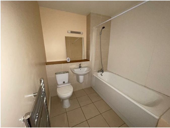
White suite comprising panel bath with shower over, low flush W.C, pedestal wash hand basin, towel rail, part tiled walls and tiled floor.