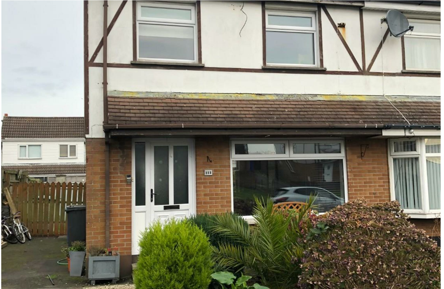
111 Towerview Crescent Bangor, BT19 6AZ