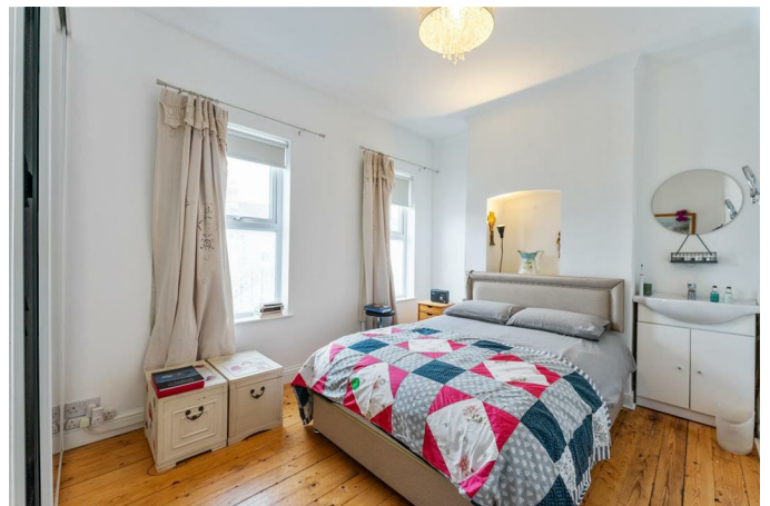
Basin with vanity unit. Solid wood floor.