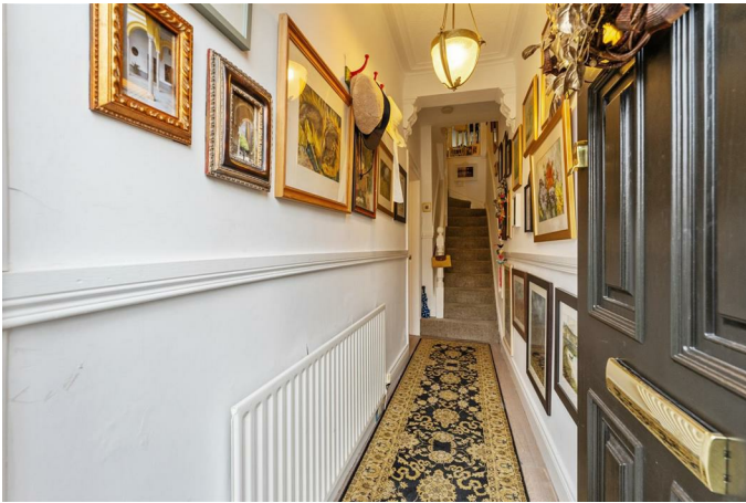
Composite front door.