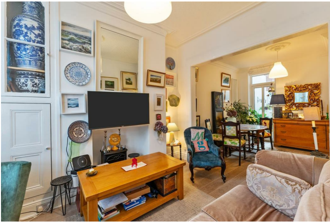
Open plan to dining. Feature cornice. Bay window.