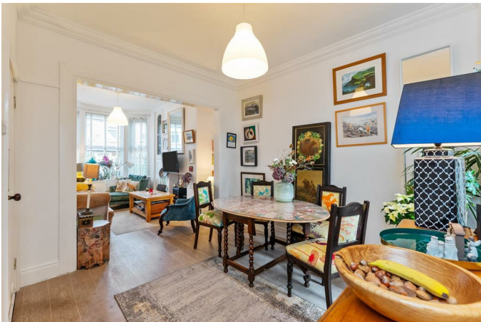
Built in storage. Feature cornice.