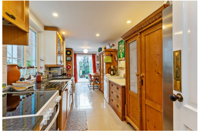
Excellent range of high and low level units, granite worktops, extractor fan, belfast sink, plumbed for dishwasher / washing machine, ceramic tiled floor and part tiled walls. Access to south facing garden.