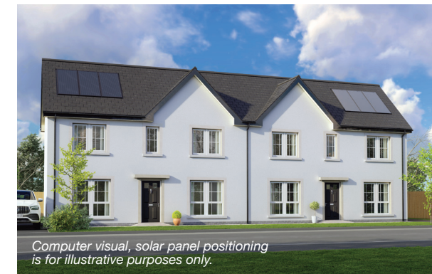
Computer visual, solar panel positioning is for illustrative purposes only.

Telephone 028 9065 5555 www.reedsrains.co.uk