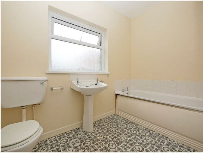
White bathroom suite comprising of low flush w.c, pedestal wash hand basin, panelled bath and corner shower cubicle. Part tiled walls and tile effect vinyl flooring.