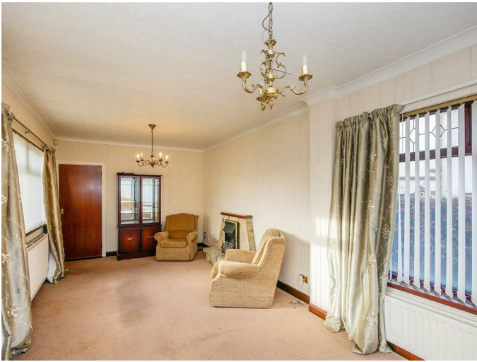
Family Room 14'3 x 10'3 (4.34m x 3.12m)