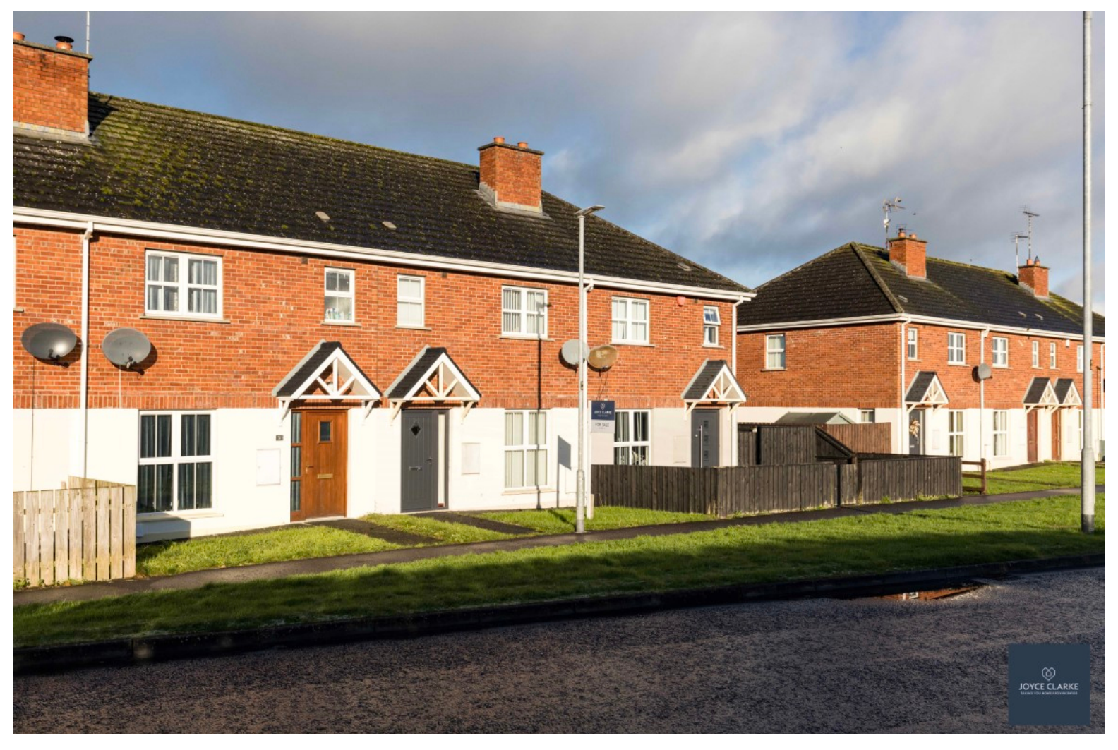
Three bed end townhouse in a highly sought after location