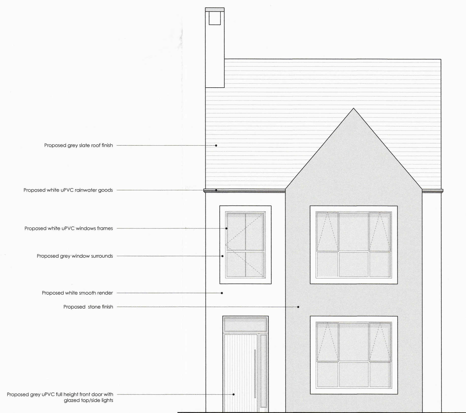
FRONT ELEVATION - DETACHED