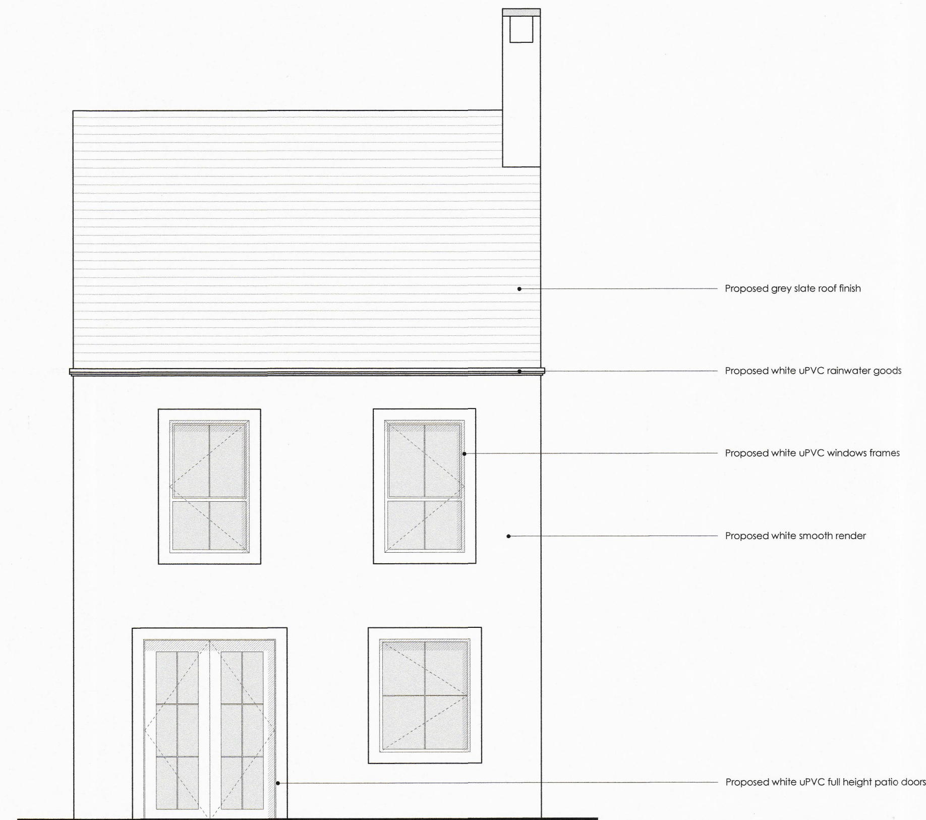
REAR ELEVATION - DETACHED