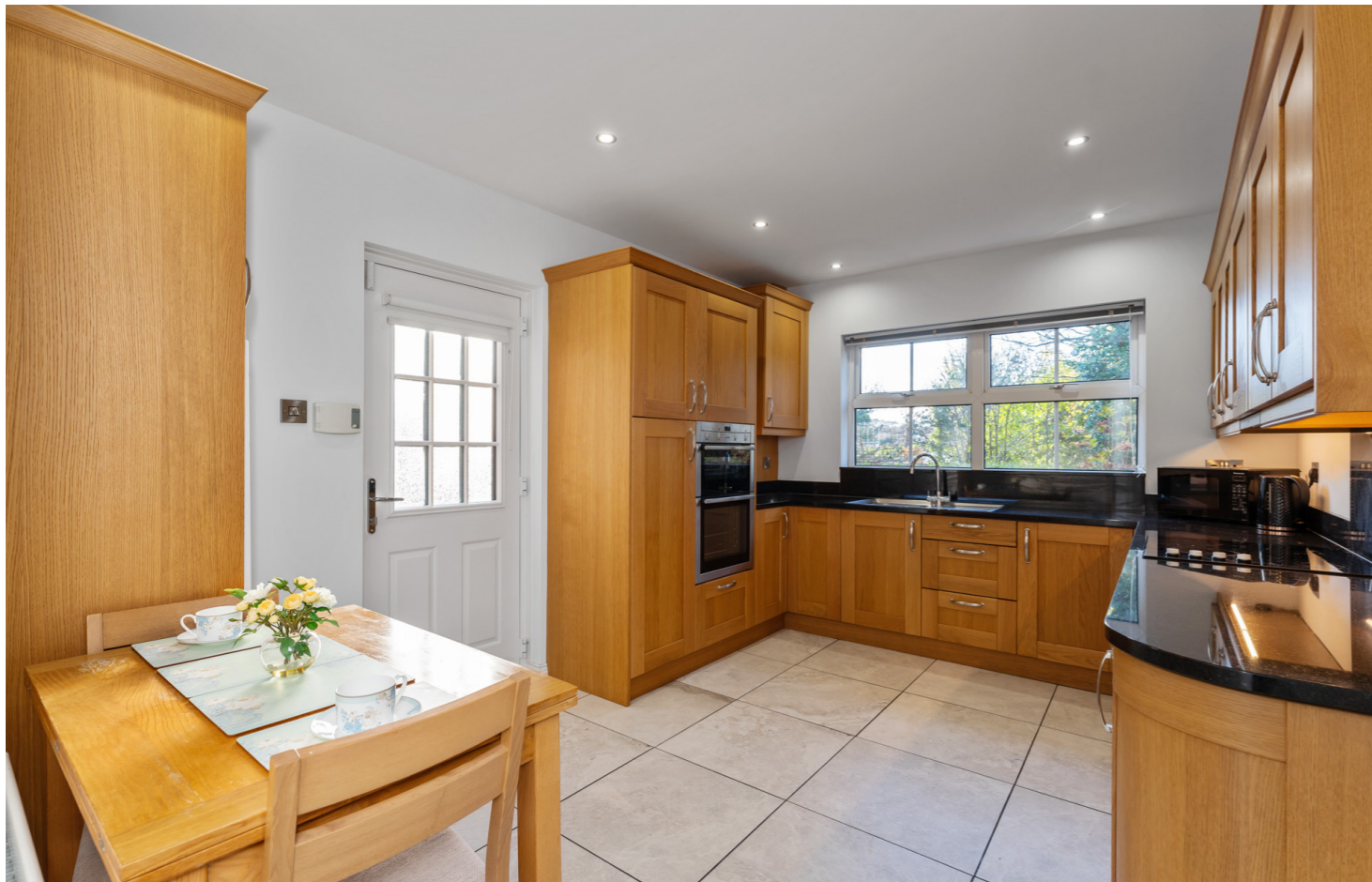
Kitchen with casual dining