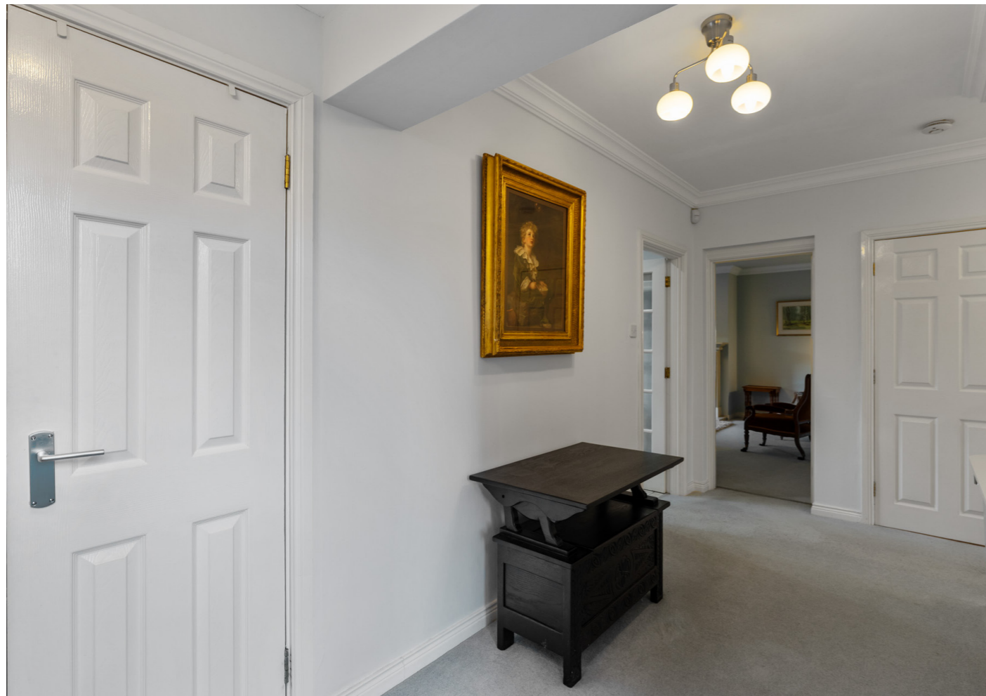
Spacious entrance hall EXPERIENCE | EXPERTISE | RESULTS