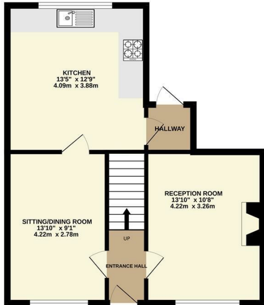
GROUND FLOOR 507 sq.ft. (47.1 sq.m.) approx.