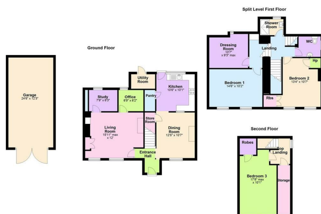
78 Grove Road, Spa

Terms & Conditions: Please note that these particulars do not constitute an offer or contract of sale. Any prospective purchaser should satisfy themselves by thorough inspection of the property and we recommend that any prospective purchaser should employ the professional services of a building surveyor and consider their findings prior to entering into contract. All such fees associated with this work will be the responsibility of the prospective purchaser regardless of whether the sale completes or not. In addition, none of the appliances or installations have been tested in any way whatsoever and it is our recommendation that a purchaser should fully satisfy themselves by employing an appropriate expert. We would also like to advise that our measurements are taken from the widest points of each room and should not be relied upon as completely accurate. You should not make decisions based on the measurements provided and double check measurements at all times. Valuation/Mortgage Service: As part of our service we would remind Vendors and potential purchasers that we have a Mortgage Broker available at this branch. If you are thinking of selling, we would be happy to carry out a free market appraisal of your property.