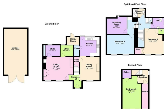
78 Grove Road, Spa

Terms & Conditions: Please note that these particulars do not constitute an offer or contract of sale. Any prospective purchaser should satisfy themselves by thorough inspection of the property and we recommend that any prospective purchaser should employ the professional services of a building surveyor and consider their findings prior to entering into contract. All such fees associated with this work will be the responsibility of the prospective purchaser regardless of whether the sale completes or not. In addition, none of the appliances or installations have been tested in any way whatsoever and it is our recommendation that a purchaser should fully satisfy themselves by employing an appropriate expert. We would also like to advise that our measurements are taken from the widest points of each room and should not be relied upon as completely accurate. You should not make decisions based on the measurements provided and double check measurements at all times. Valuation/Mortgage Service: As part of our service we would remind Vendors and potential purchasers that we have a Mortgage Broker available at this branch. If you are thinking of selling, we would be happy to carry out a free market appraisal of your property.