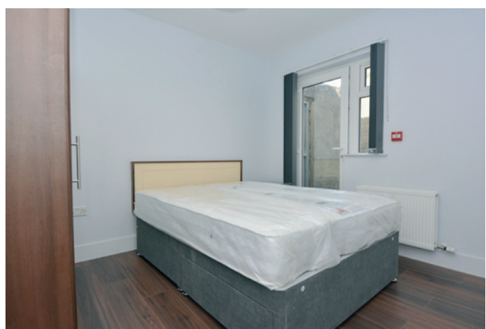
PLEASE NOTE: PHOTOGRAPHS ARE A SELECTION FROM VARIOUS APARTMENTS