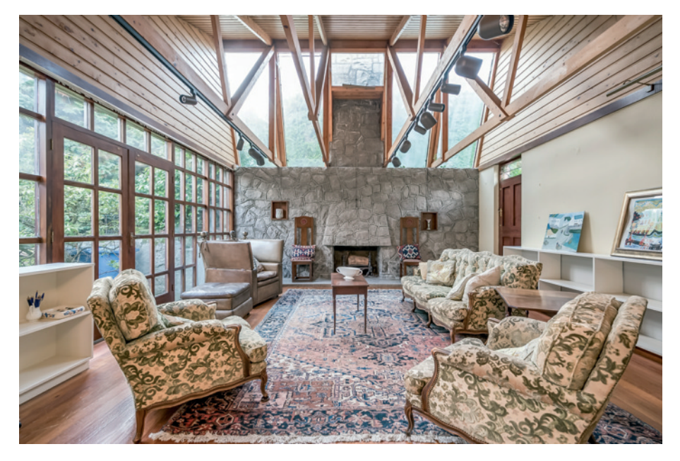
DRAWING ROOM: 25' 6" \times 17' 0" (7.77m \times 5.18m) Feature stone chimney breast with open fire with dog grate, window overlooking private garden area.