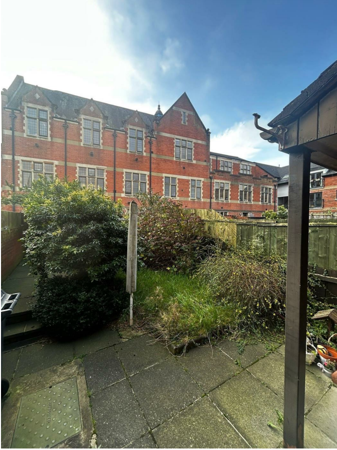
Large patio area to rear with outhouse.