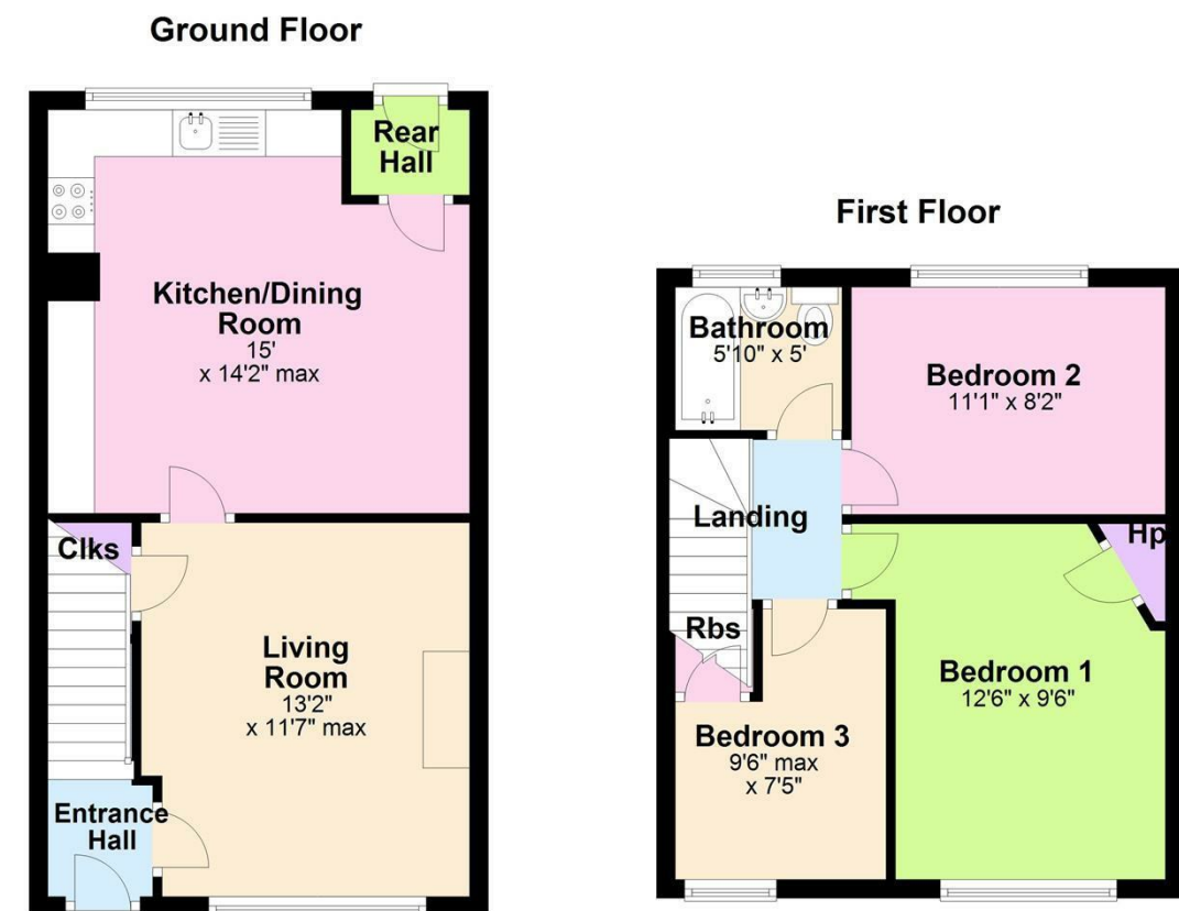
58 Millar Park, Laurencetown