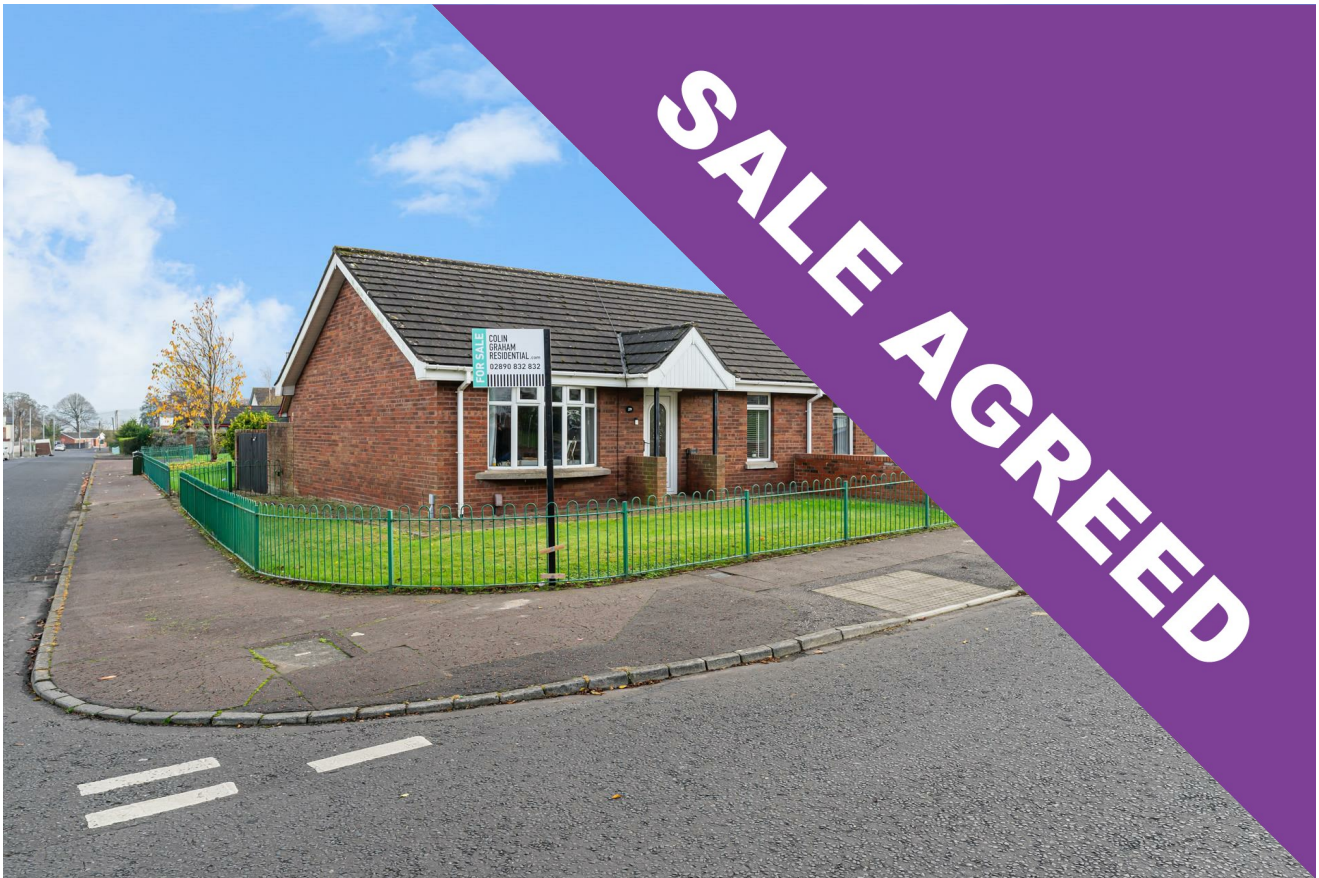
29 Abbeyville Place, Newtownabbey, BT37 0AQ