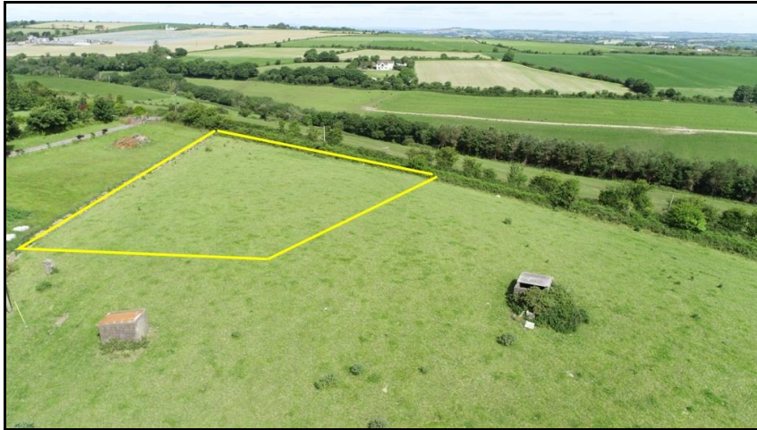
Approx layout of site. For descriptive purposes only